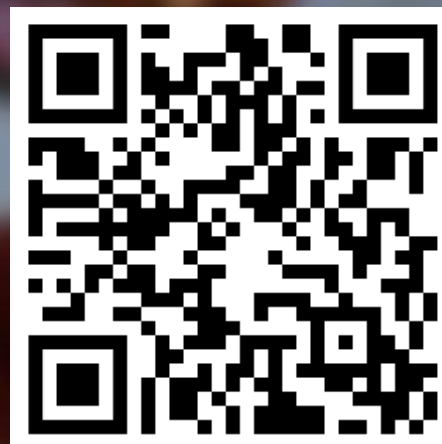
Contact Information Form

ALL MEMBERS – Transition to CutTime Emails & Text Reminders Volunteering Skills & Interests