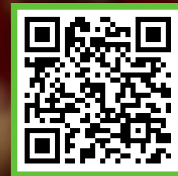
Regiment Announcements BAND