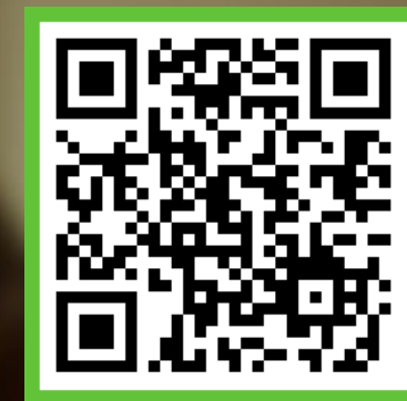
Program Announcements BAND